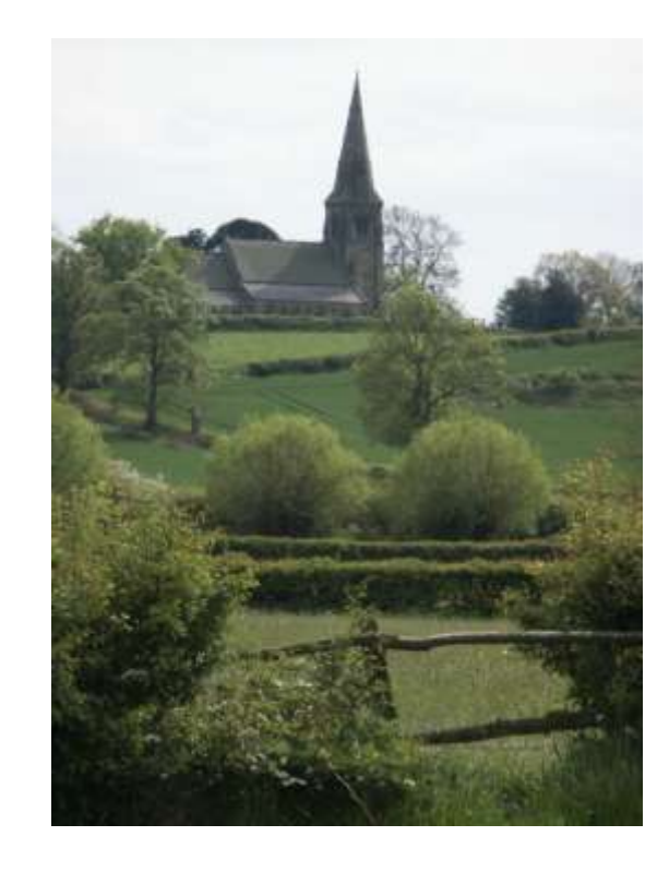
Route length - 19 Miles

Produced by the Burton Group of the Cyclists' Touring Club, Derby Section