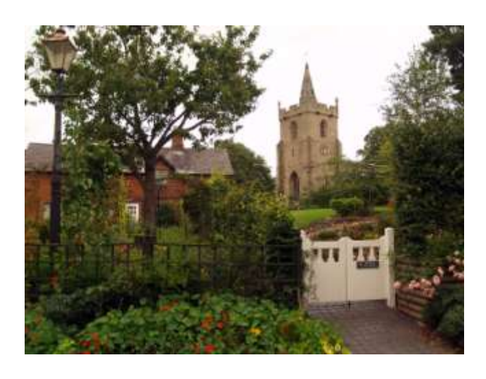
Route length - 19 Miles

Produced by the Burton Group of the Cyclists' Touring Club, Derby Section