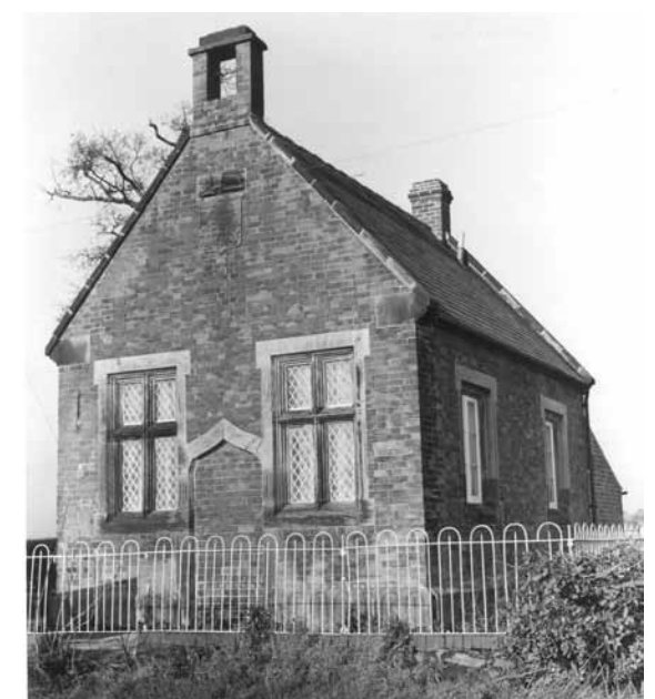
Twyford School was only small but was 'dressed to impress' and stood proudly on the main road where all could see it. It was saved from dereliction by the Derbyshire Historic Buildings Trust.

Twentieth century amenities were slow to come to the village; electricity was not connected until 1939 and there was no mains water supply until 1959.