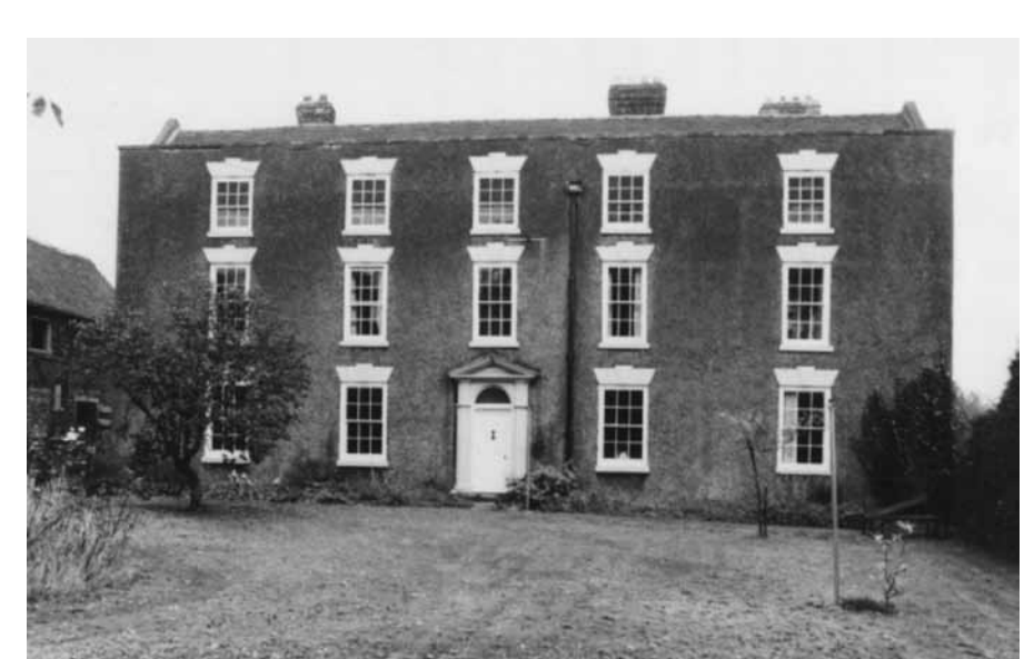
The gauche proportions of the front elevation of the Hall stem partly from its evolution over time. The frontage has been widened from three bays to five by the addition of a window at each end, and the roof line has been raised. The upper parts of the attic windows are blind and exist for cosmetic effect only, relics of a time when large windows were a status symbol.

The 17th century hall was in the vicinity of the present house, but it is uncertain whether the present building occupies the very same spot. It descended through the family until it was offered for sale in 1856 and was then bought by the Harpur Crewe estate. In 1863 the Hall was radically modernised and became a tenanted farm until it was sold in the 1980s; it has not been altered substantially since.