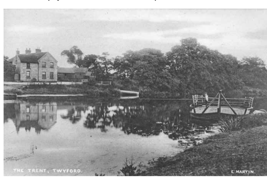
The chain ferry at Twyford around 1900. The ferry survived until 1963.

The name serves as a reminder that fords and ferries were very common alternatives to bridges into the 20th century. William Woolley the Derbyshire historian, writing in 1712, mentions a ferryboat at Twyford, and Viscount Torrington the famous diarist used the ferry in 1790 with his two horses: "Po was very quiet in the boat, but Blacky was much alarmed."